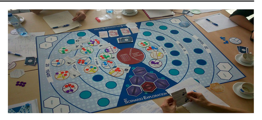
Fig. 2 JRC Scenario Exploration System

compare and contrast situations and potential solutions, leading to fruitful strategic discussions.